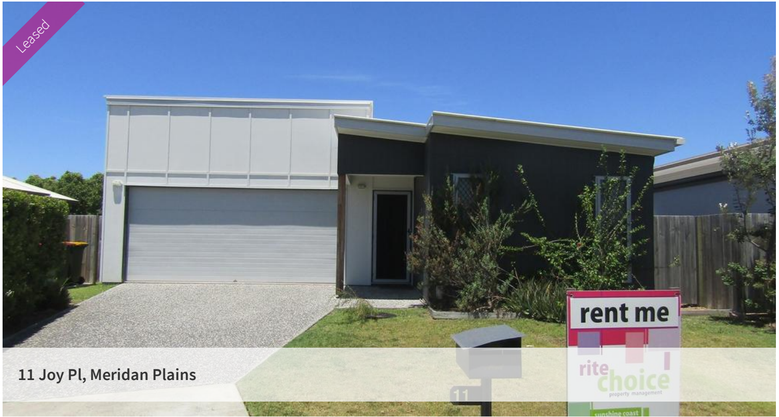
11 Joy Pl, Meridan Plains